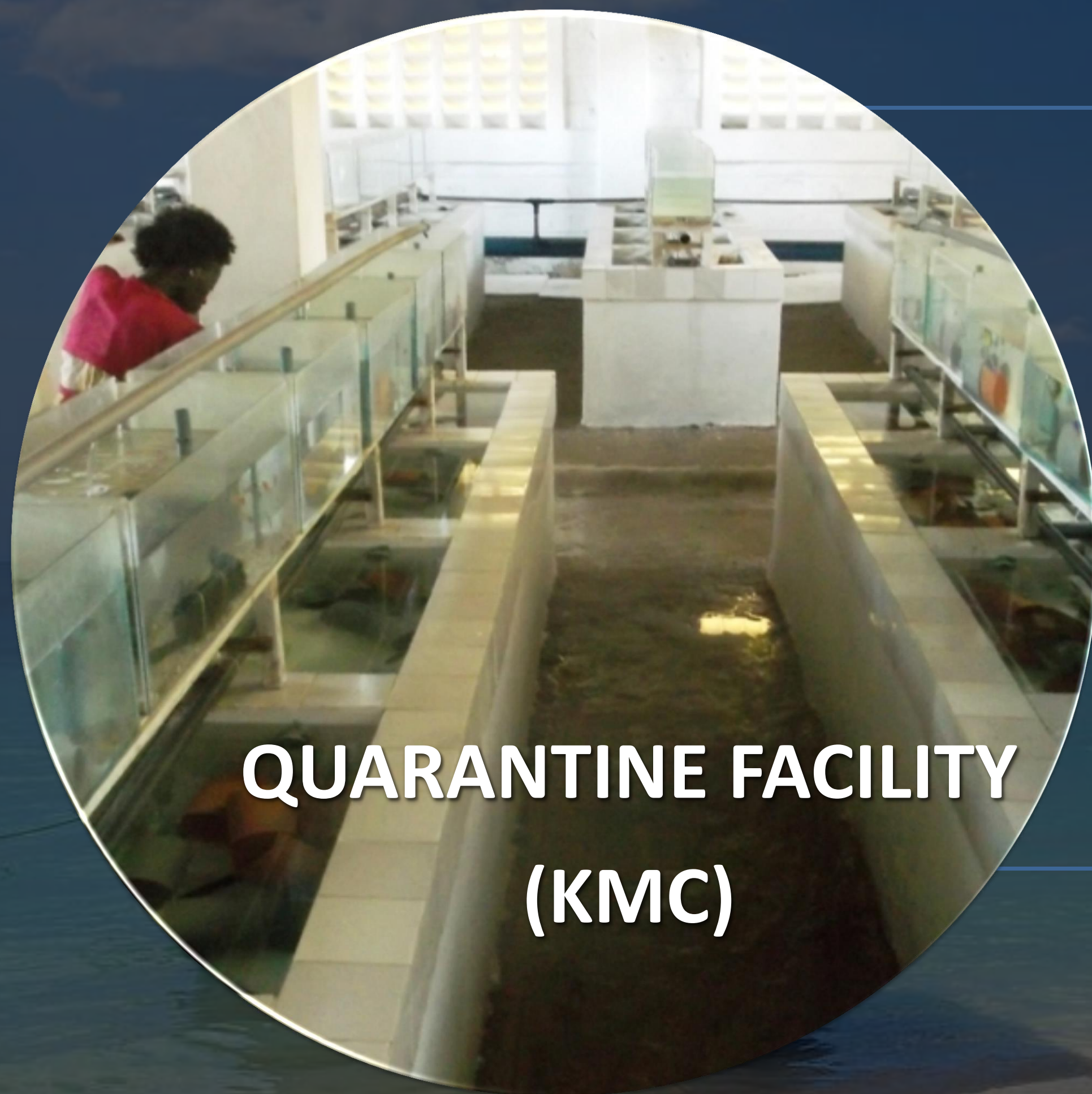
QUARANTINE FACILITY (KMC)