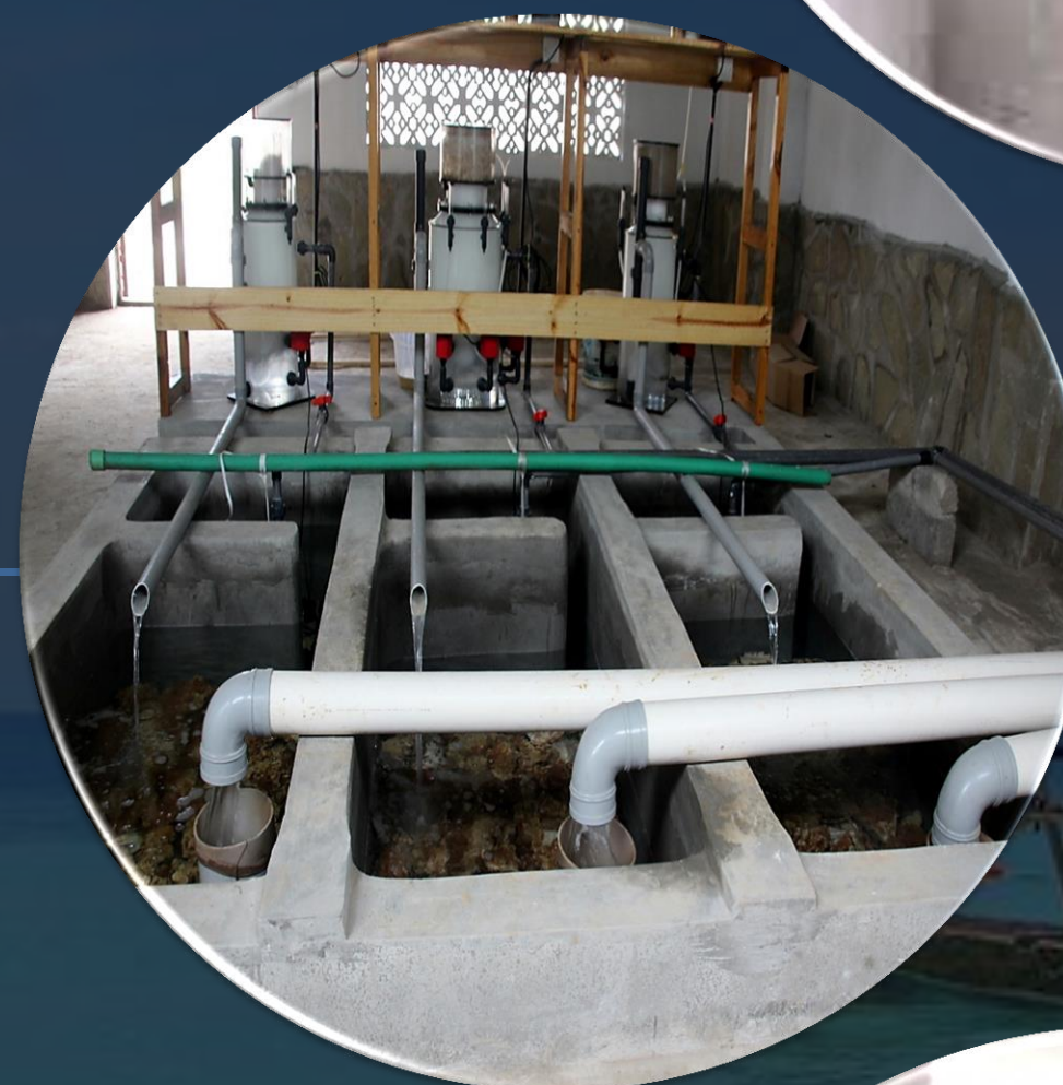
STATE OF THE ART EQUIPMENT